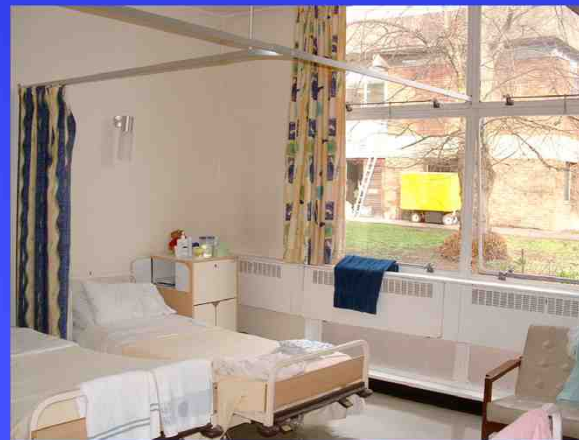
• 32 Rehabilitation Beds