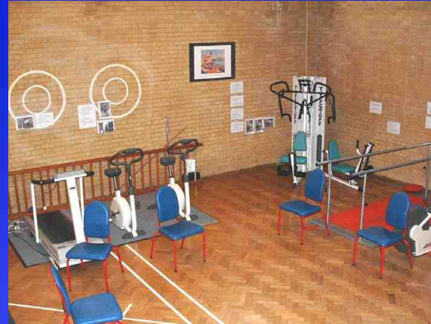
• Three Physiotherapy Gyms