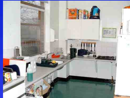
• ADL Kitchens