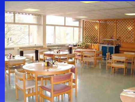
• Patient Areas