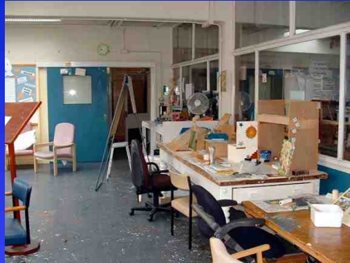
• OT Workshops